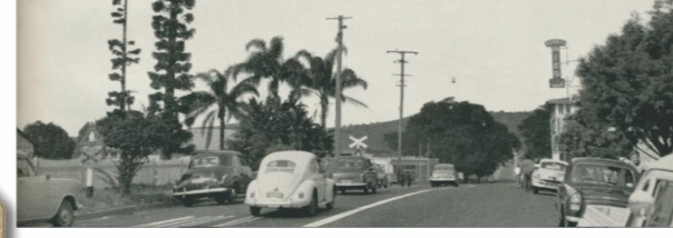
The Pacific Highway passing through Beenleigh

River Road Tavern are a proud part of the community on Logan River Road. Built on land that has a rich history, Beenleigh became home to the early settlers who developed farms and sugarcane plantations in the 1800s.